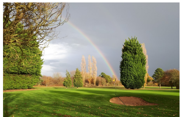
Interesting weather over the 6th green